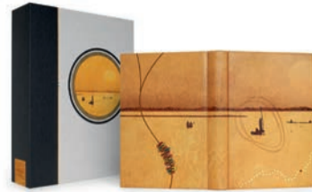
A. Fine binding

Entries in this category should be a binding of a contemporary nature in a codex form displaying an excellent standard of craftsmanship, along with an outstanding overall concept and design. Entries will be judged on the quality of the concept and design; the forwarding; finishing; craft skills; and use of materials.