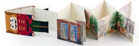
B. Complete Book

Entries in this category should be a binding of a contemporary nature in a codex form displaying an excellent standard of craftsmanship, along with an outstanding overall concept and design. Entries will be judged on the quality of the concept and design; the forwarding; finishing; craft skills; and use of materials.