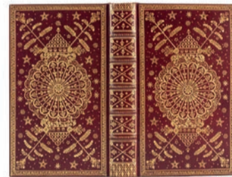
E. Historic Binding

Any binding repaired in a way that returns the book to a former or original condition. Entries will be judged on the suitability of the repairs; the aesthetic of the restored book; craft skills; documentation; and materials used. Entries must be submitted with photographic documentation prior to restoration, along with a full written record of all work undertaken.